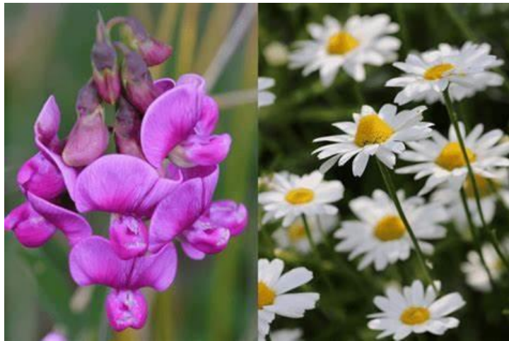
Birth Flowers for April- Sweet Pea and Daisy

Eastampton News provides information, helpful tips and reminders related to Eastampton Township and the surrounding areas. The Township is continually working to help keep residents informed about our community.