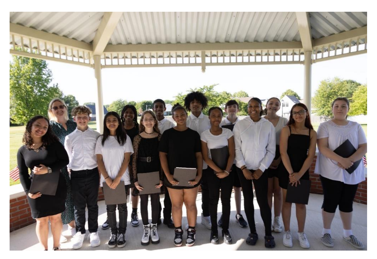
ECS Select Chorale