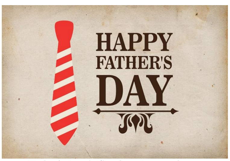
Father's Day is Sunday, June 18th

12 Manor House Court Eastampton, NJ 08060 (609) 267-5723 www.eastampton.com