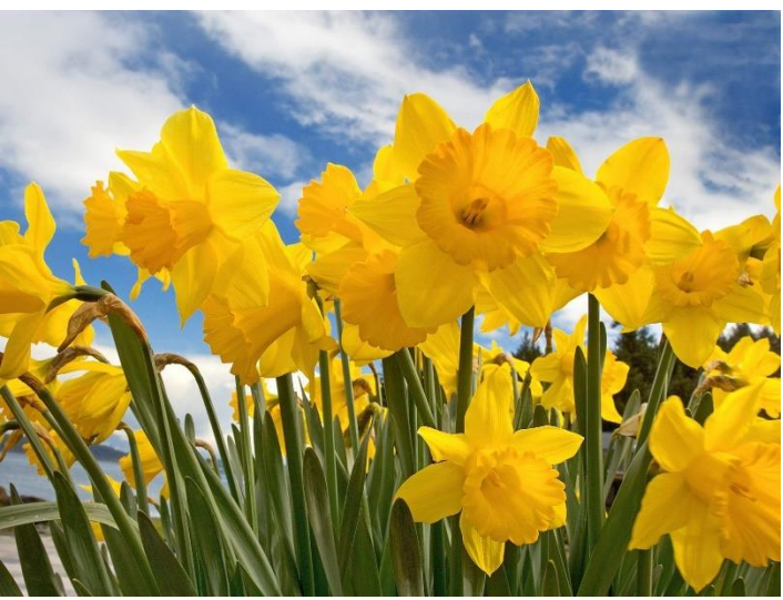
Daffodil is the primary birth flower for people born in March. The word daffodil came from the Old English word "Affodyle," which means "that which comes early."

12 Manor House Court Eastampton, NJ 08060 (609) 267-5723 www.eastampton.com