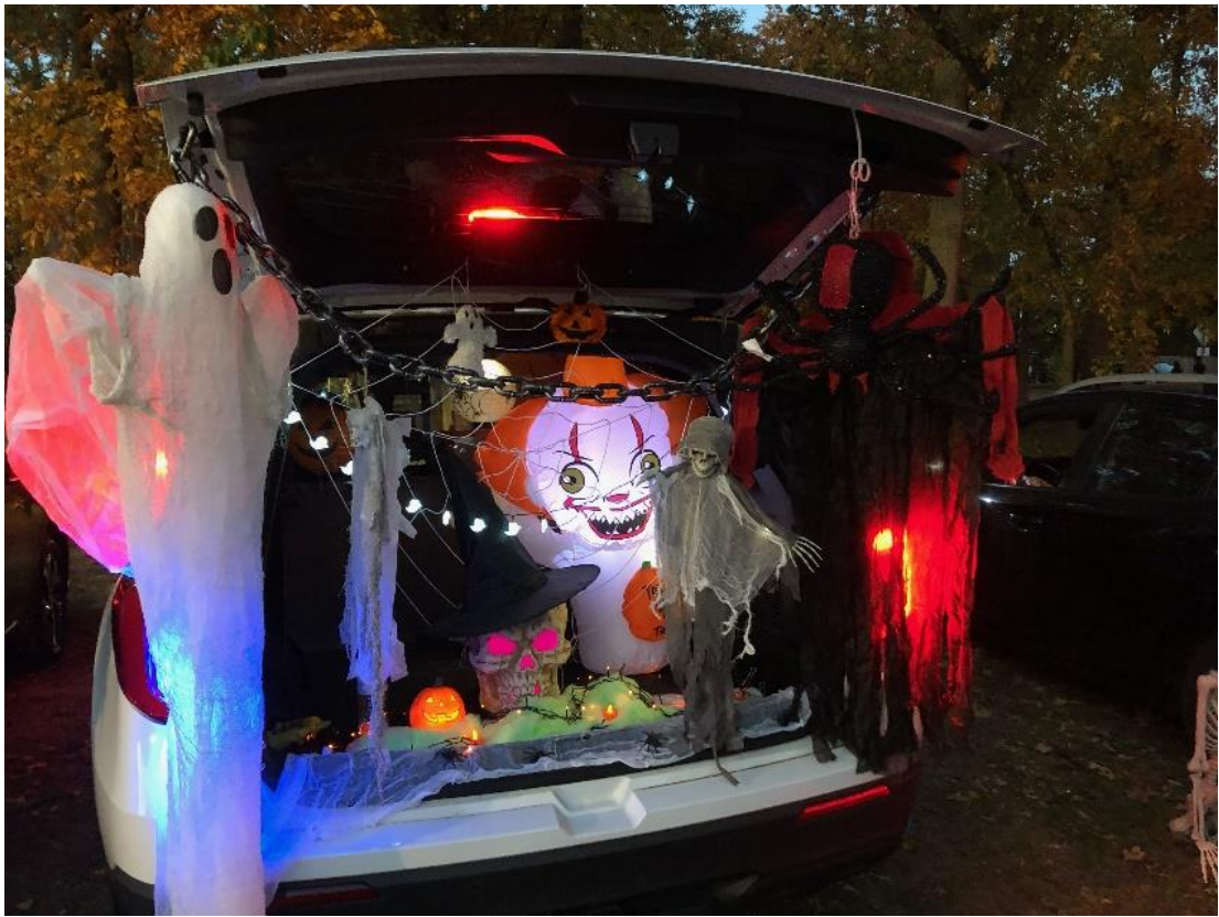
Eastampton Township Police Department