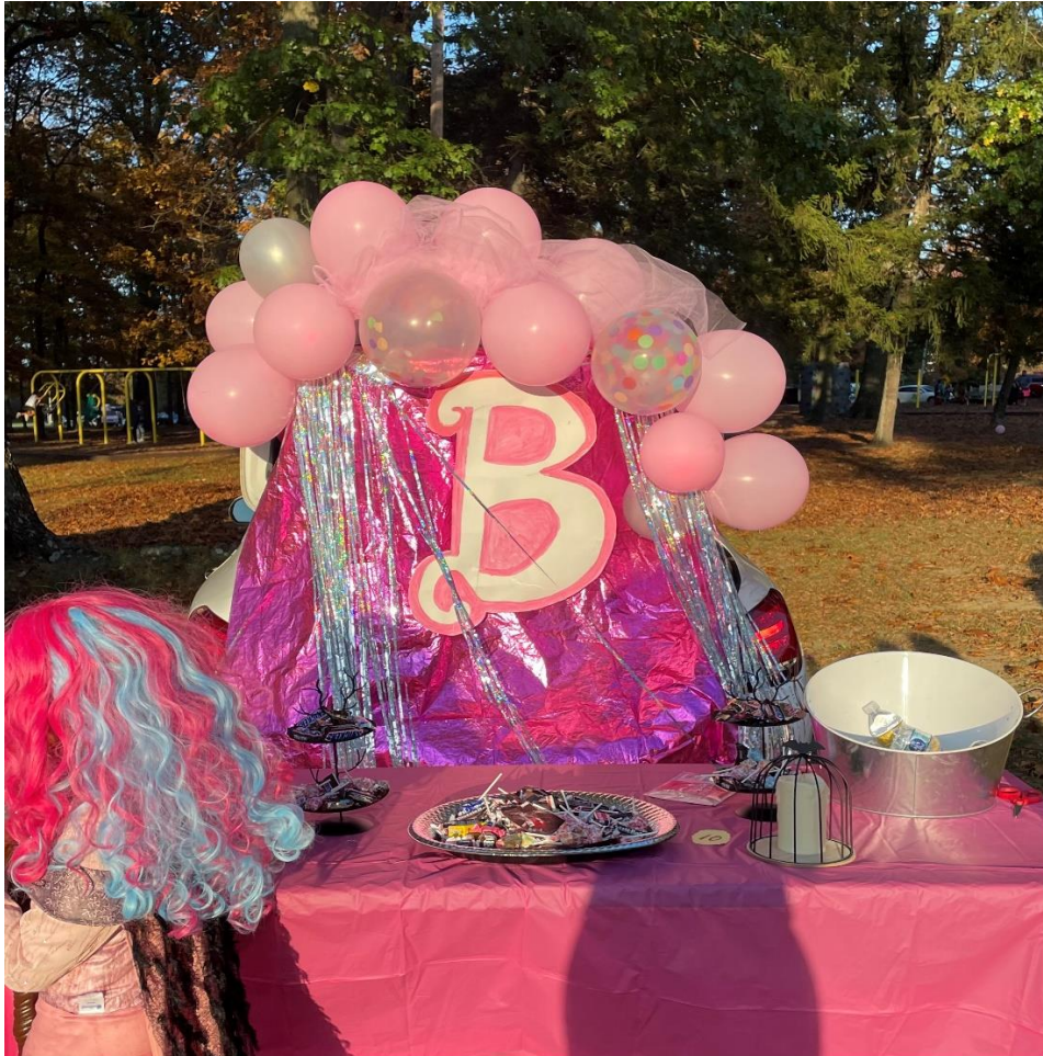
The Murray Family