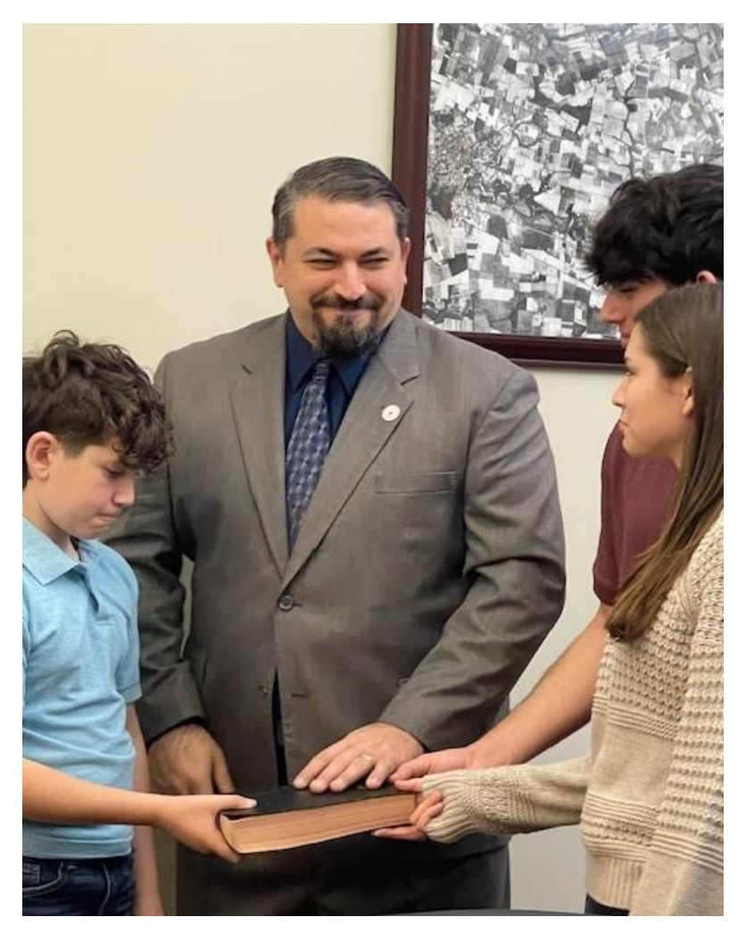
MAYOR DOMINIC F. SANTILLO