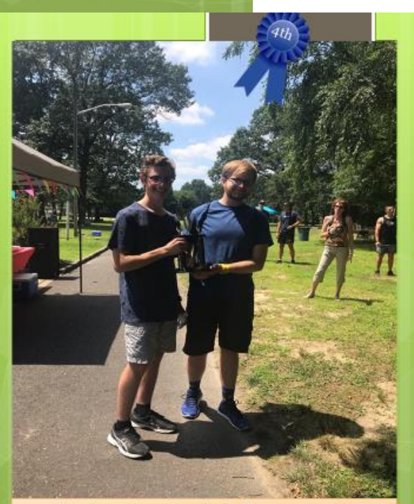
Eastampton Cornhole Tournament Fourth place winners Team "Boy Pants & Shorts"