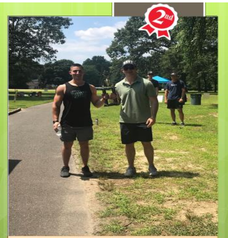
Eastampton Cornhole Tournament Second Place Winners Team "Gabagoonies"