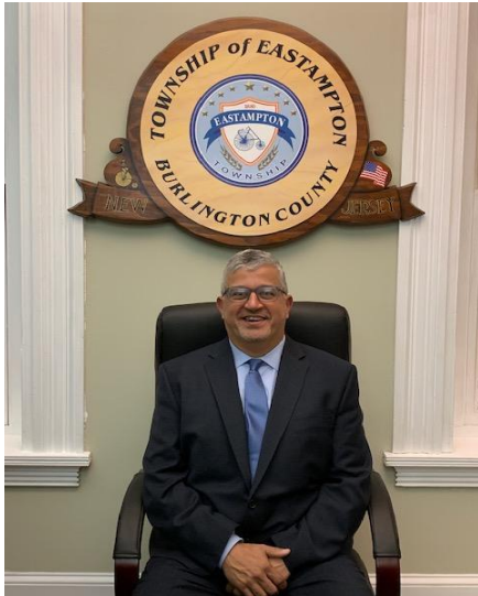
Mayor Anthony Zeno