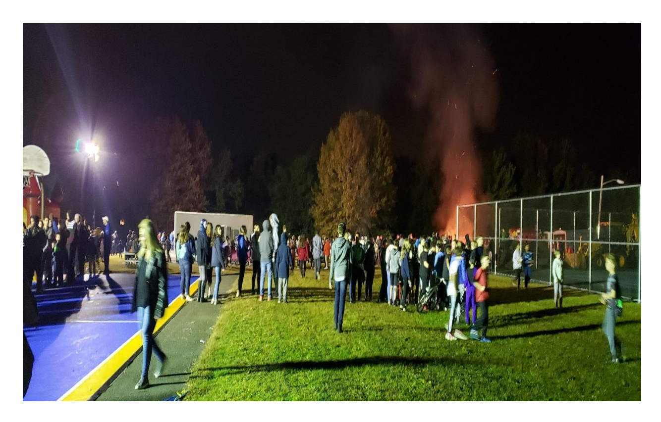
There was a huge crowd to enjoy the many fun things to do at Eastampton's 2019 Hayride/Bonfire!