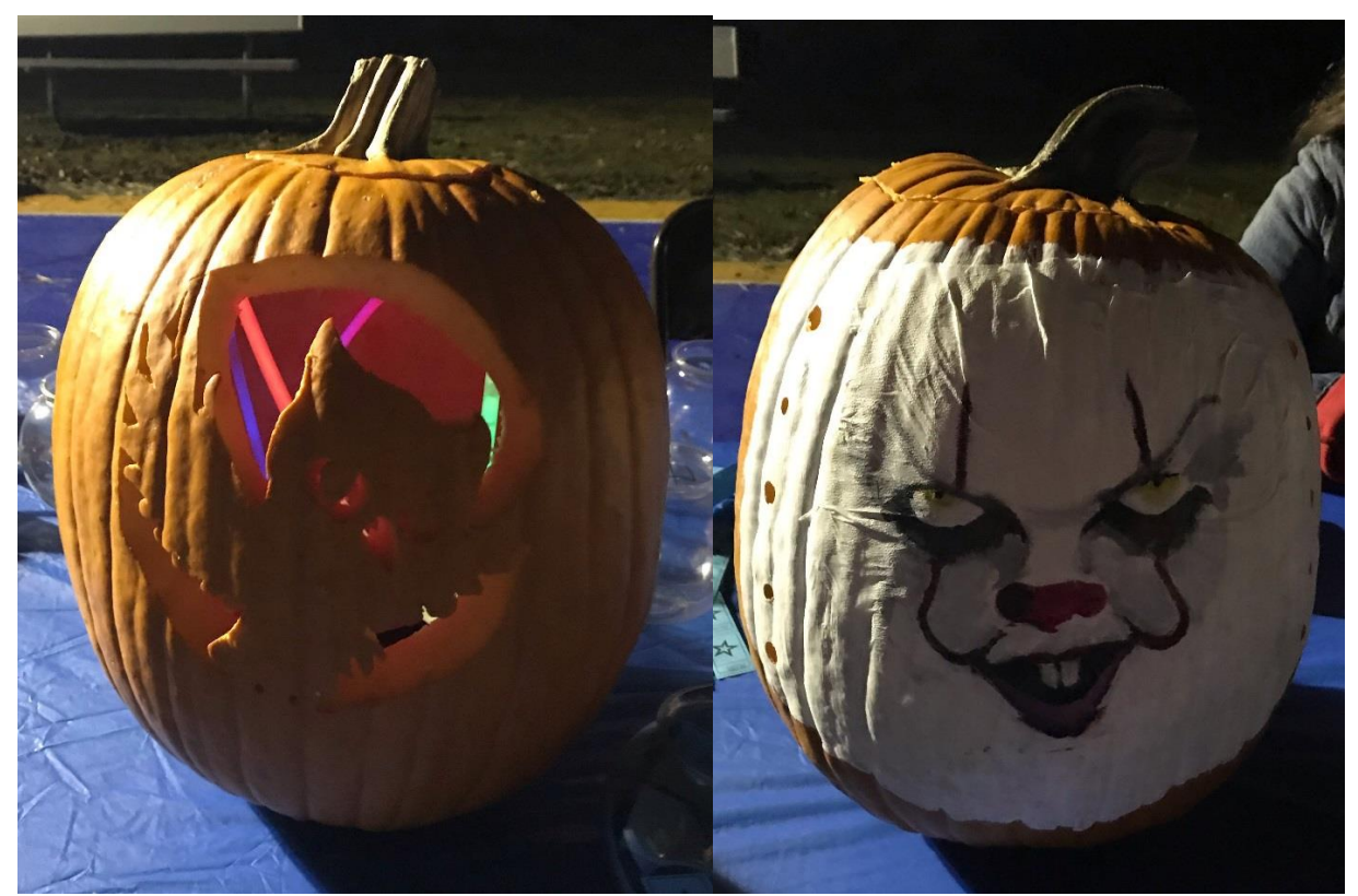
2<sup>nd</sup> Place Winner!