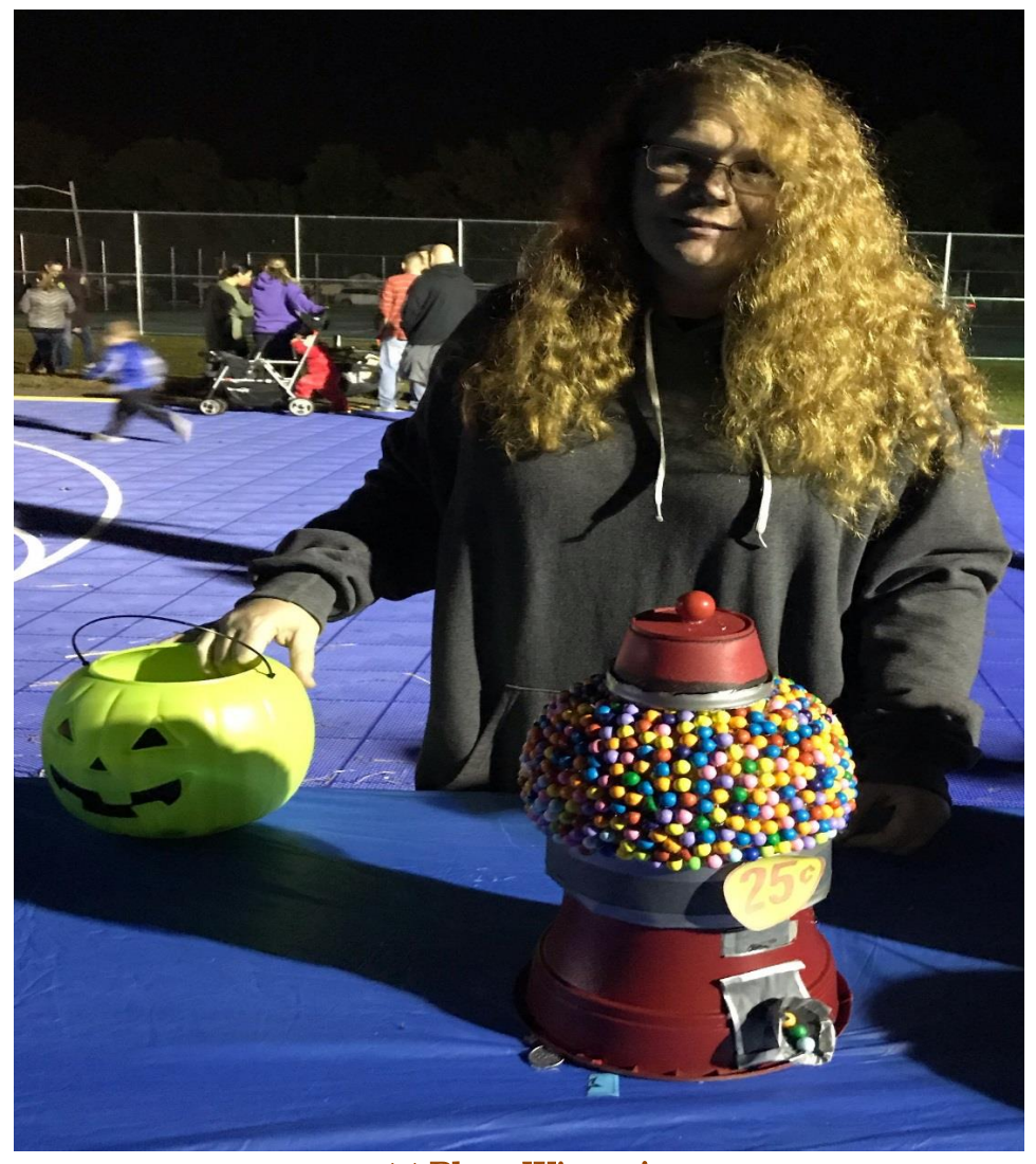
1st Place Winner!