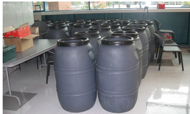
Closed top (left) and screw top (right) plastic food grade 55 gallon barrels.

Two types of plastic food grade 55 gallon barrels are typically used to make rain barrels; screw top (the whole top unscrews) and closed top (with two 2-inch "bung holes"). The screw top enables you to reach deep inside the barrel to work on the inside of the faucet. With the closed top barrel, you will only be able to install the faucet as far down as you can reach inside the barrel from the hole you will cut in the top.