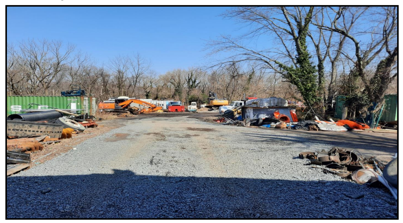
10. Standing at the rear of Lot 4.01 looking northerly towards Lot 4.03.

9. Standing at the rear of Lot 4.01 looking southerly at the rear face of the existing 1 story masonry building.