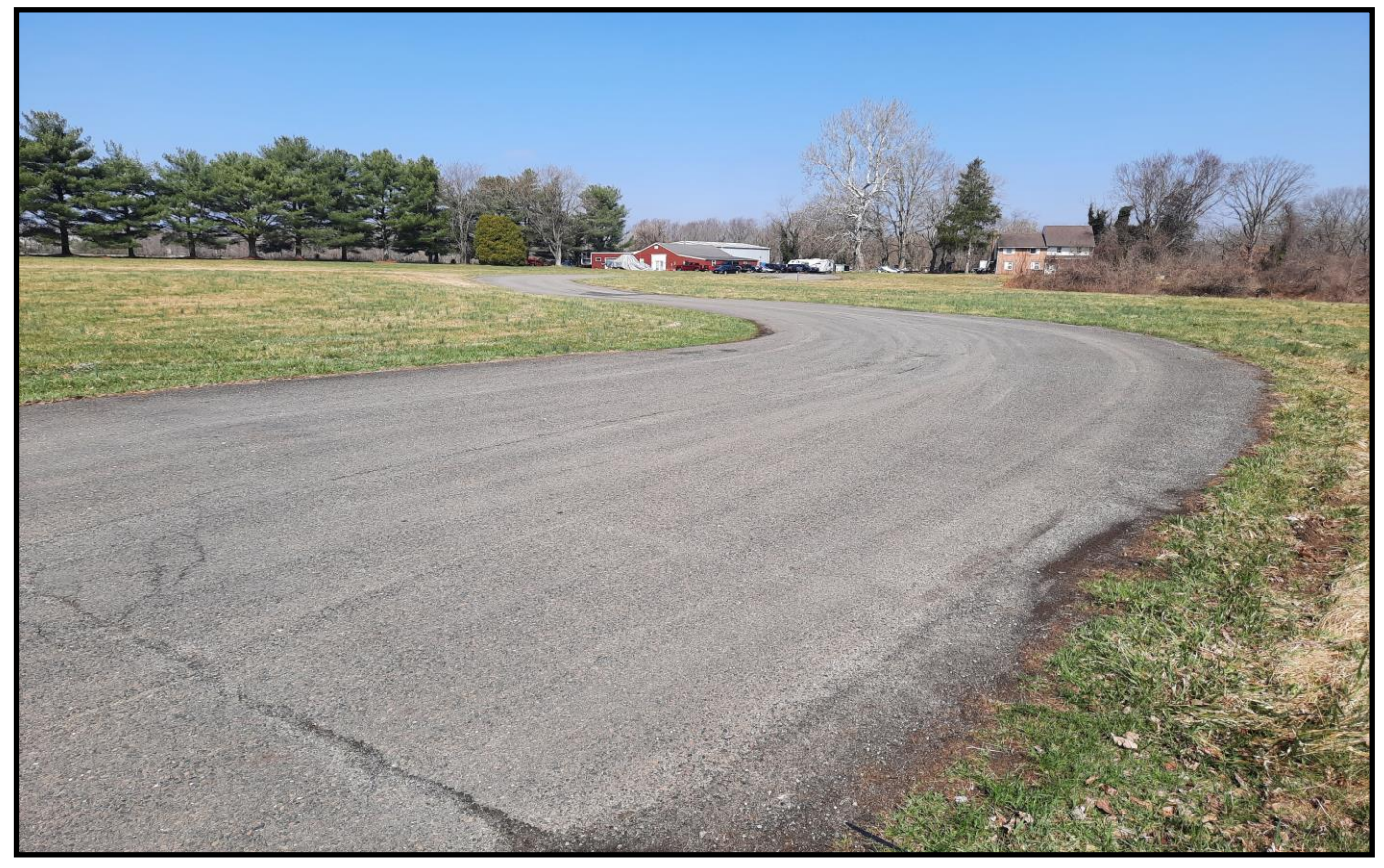
4. Standing at the driveway entrance of Lot 4.01 looking northerly towards Block 800, Lot 4.02.

3. Standing at the driveway entrance of Block 800, Lot 4.01 looking southerly across Woodlane Road.