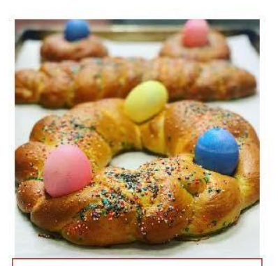
Braided Easter Egg Bread: Sweet bread dough hand-braided with colored hard-boiled eggs.

The Olde World Bakery & Café, a landmark bakery for 24 years, is proud to offer traditional Italian breads and sweets for Easter! Order your Tortano, Braided Easter Egg Breads and Pound Cake Lambs and Bunnies for the upcoming holiday! We also have imported chocolates and candies from Italy available for purchase. We hope to see you soon!