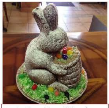
Easter Bunny Pound Cake: Comes on a tray wrapped in cellophane, with shredded coconut grass and jelly bean eggs!