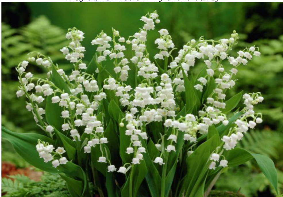
May’s birth flower-Lily of the Valley